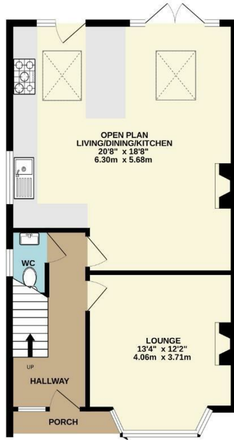
GROUND FLOOR 630 sq.ft. (58.5 sq.m.) approx.